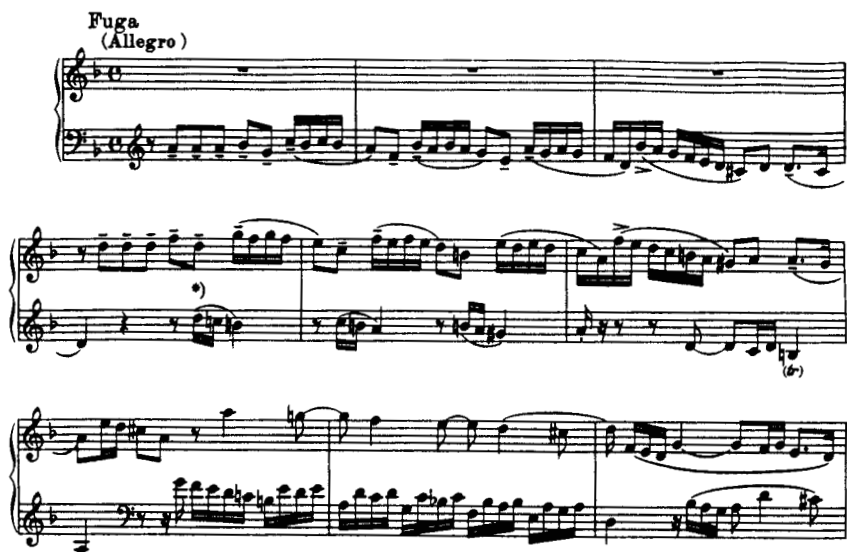
Example 1: J.S. Bach, Fantasy and Fugue in D minor, BWV 905: "Fugue," mm.1-9 ( Busoni-Ausgabe).

hitherto unheard of, the polyphonic additions actually become so extensive that he rightly describes them as metamorphoses. The following words, which Sorabji wrote in his essay "Leopold Godowsky as Creative Transcriber," can easily be applied to Busoni: